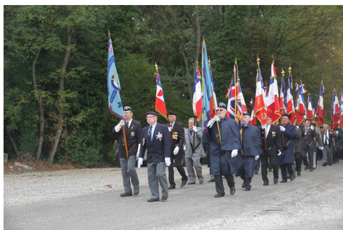
With punctilious courtesy our French friends placed our three Standards (Lyons branch, Swiss branch and Union Flag) at the front of the parade

The well-ordered parade formed up punctually at 11.00, at the old schoolhouse courtyard for the traditional rendering of respect to " Capitaine Vic " and his fellow Résistance fighters. Some 18 Swiss and Lyon