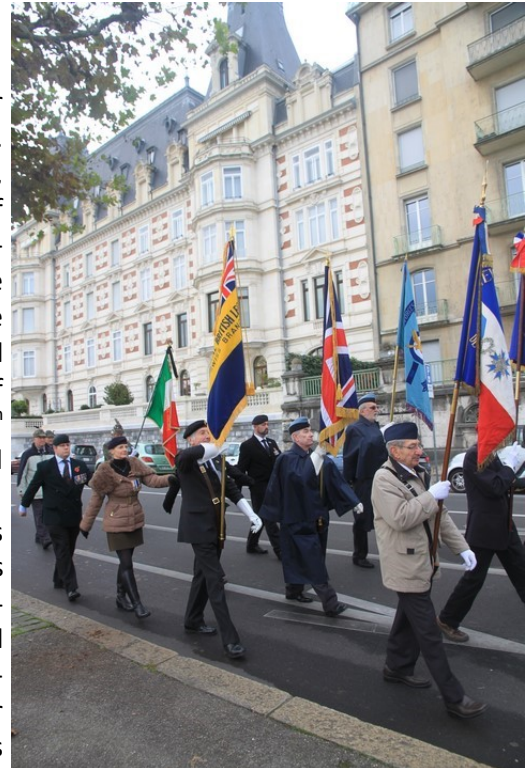
UK Standard Bearers and veterans making a fair fist of marching in step—until the band changed beat again. We deliberately did not keep track of how many times the Cadets de Genève changed beat.

attendance has changed for the better. On the day, the city of Geneva observes the end of the first global conflict of the 20 th century and remembers the citizens and soldiers from Geneva who died in the service of their country. It is also a time to pause and honour the dead of