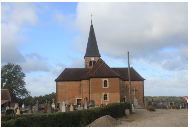
The church of St Bernard above the village. The crew are buried in the cemetery.