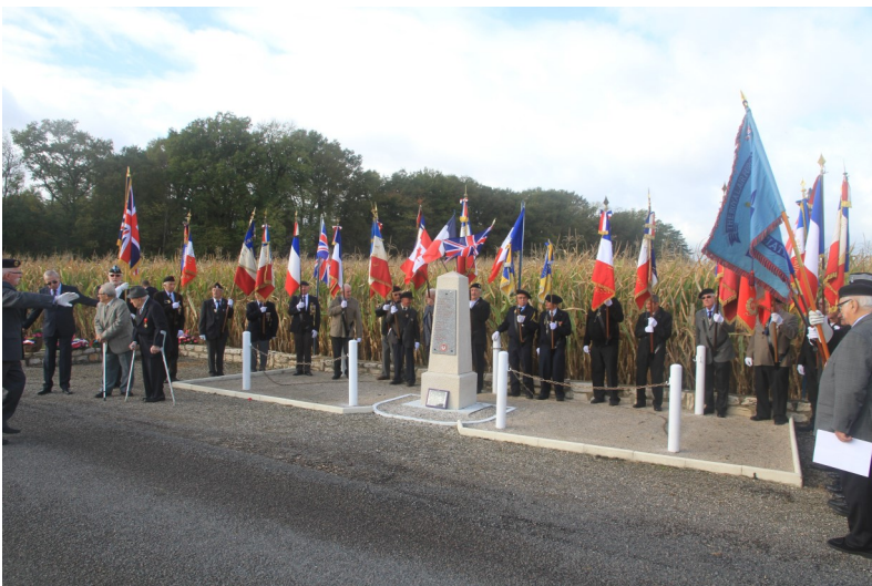
Above: The stèle commemorating the crash site of the aircraft. The Union Flag and the Lyon Standard are paraded left and right of the memorial. Our French comrades take their accustomed places as they do every year.