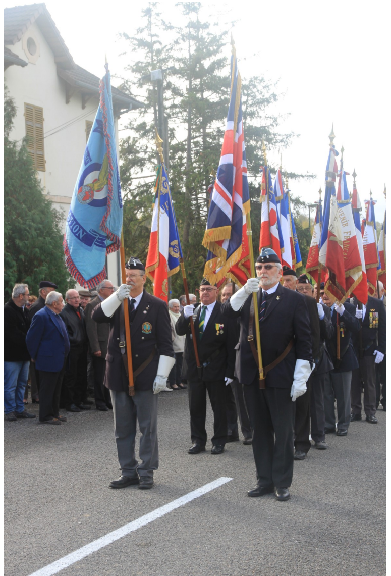
Above: The Standard Bearers formed up after the first wreath has been laid. Next stop the church of St Bernard—up the hill. That hill gets steeper and steeper, but we all still manage.